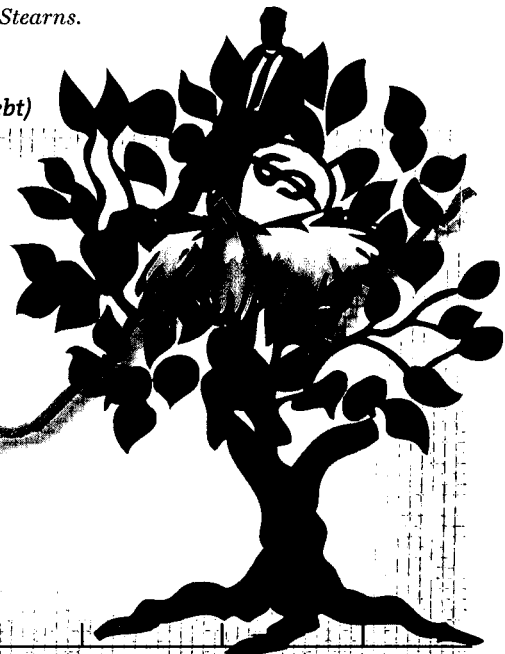
CHART ILLUSTRATION BY ALEX REARDON