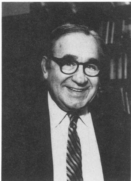
Robert W. Fogel