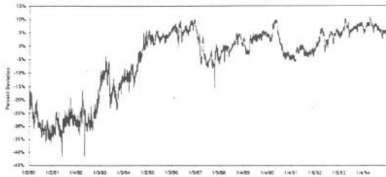
Figure 1. Log deviations from Royal Dutch/Shell parity.